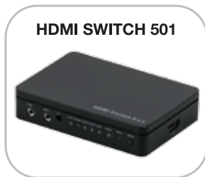
HDMI Switch 5x1